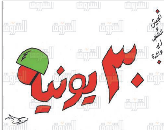
Cartoon (3) 43