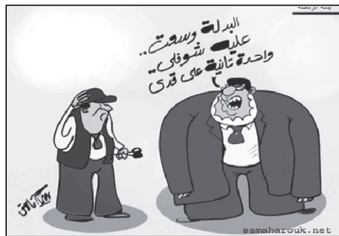
Cartoon (2) 2

I have analyzed each of the main points of interest depicted in the cartoons according to the three categories 1) visual depictions, 2) actors presented, and 3) wordplay and sarcasm.