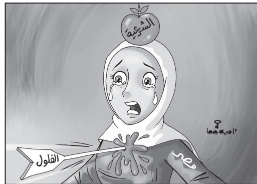
Cartoon (6) 63

C1) Visual Depictions: Cartoons that observed the will of the Egyptian people, focused mainly on the unity among Egyptians, and the public agreement to end Morsi's regime. A large number of cartoons depicted Egyptians as unified under one flag that says, "Go, Loser!" (see Cartoon 5). In this cartoon, the Egyptians are surrounded by pyramids, churches, mosques and palms. 64 In another cartoon published in Al-Ahram , people are shown to build a pyramid with their bodies and hoist the country's flag 65 because Egyptians cannot take the mistakes of the regime anymore and will explode 66 .