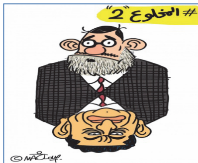
Cartoon (1) 1